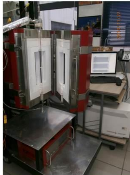
Fig. 3 Installed THERMASYS furnace and quartz reactor of the experimental unit for CLC process

Published Articles and Presentations in Conferences